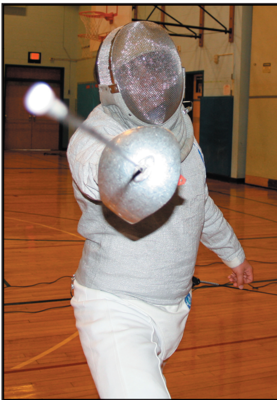
GRAPHIC: MELISSA ROSENBERG

The sabre is lighter than the epee, but heavier than the foil. The sabre differs most from the other two weapons because it is a slashing weapon as opposed to a poking weapon. Sabre competitors can only hit their opponent from the waist up, which includes the arms and the head.