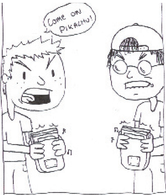
Pokémon, one of the greatest influences of our generation