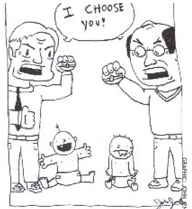
God help the next generation...

The series of Pokémon games for the Gameboy is less overlooked by the population of Huntington High School as compared to the show. With four generations of games already released and a fifth on the way, a considerable amount of the student body still enjoys virtually training Pokémon and collecting badges. When Pokémon Heart Gold and Soul Silver were released last year, it was not uncommon to see students walking excessively around the halls or tapping their feet during class as they were wearing Pokéwalkers, a new accessory included with the game.