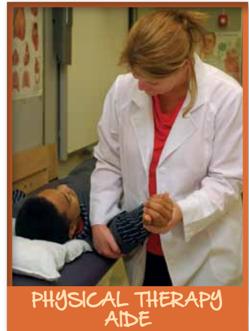
PHYSICAL THERAPY AIDE