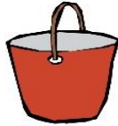
Informative / Explanatory