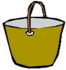
Opinion / Argument