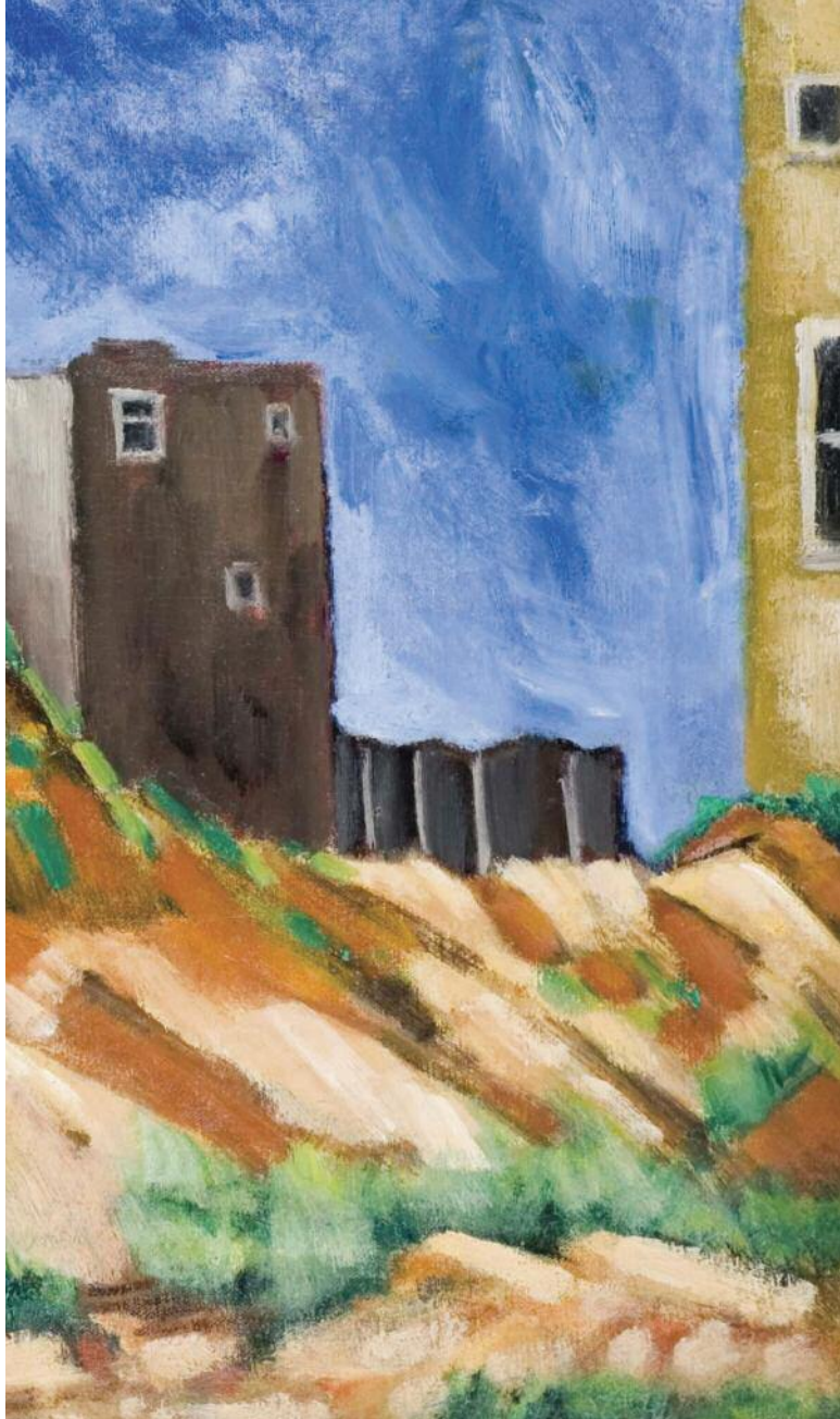
Cover: Max Weber, Sea Cliff (detail), 1935. Estate of Max Weber, Courtesy Gerald Peters Gallery, New York.

The Heckscher Museum of Art 2 Prime Avenue Huntington, NY 11743-7702 631.351.3250 www.heckscher.org