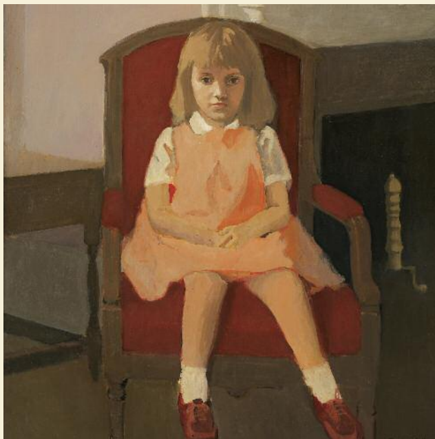
Fairfield Porter, Elizabeth in a Red Chair (detail), 1961. (On view in Across Time & Place )