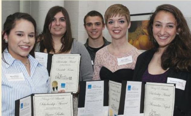
Long Island's Best: Young Artists at The Heckscher Museum Award Winners, 2011