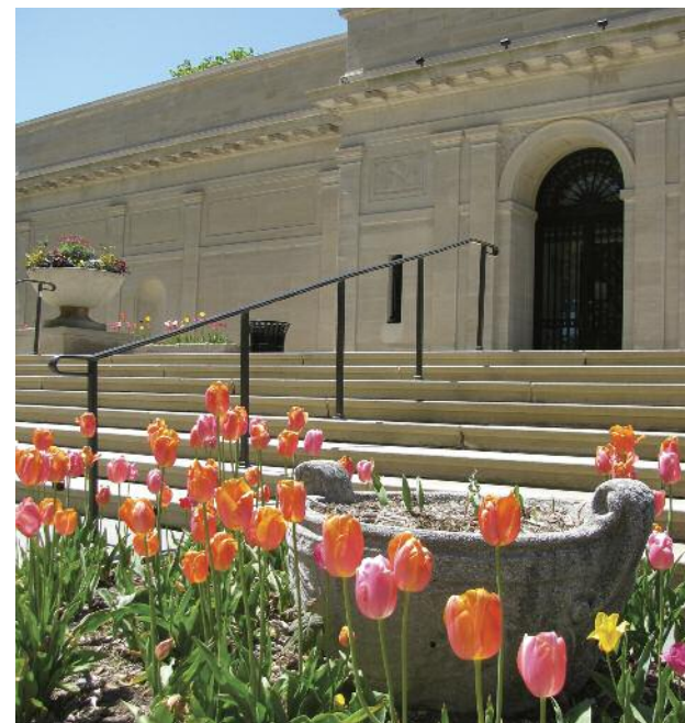
The Heckscher Museum

Give the gift of membership. To have your special membership gift package sent, call 631.351.3006.