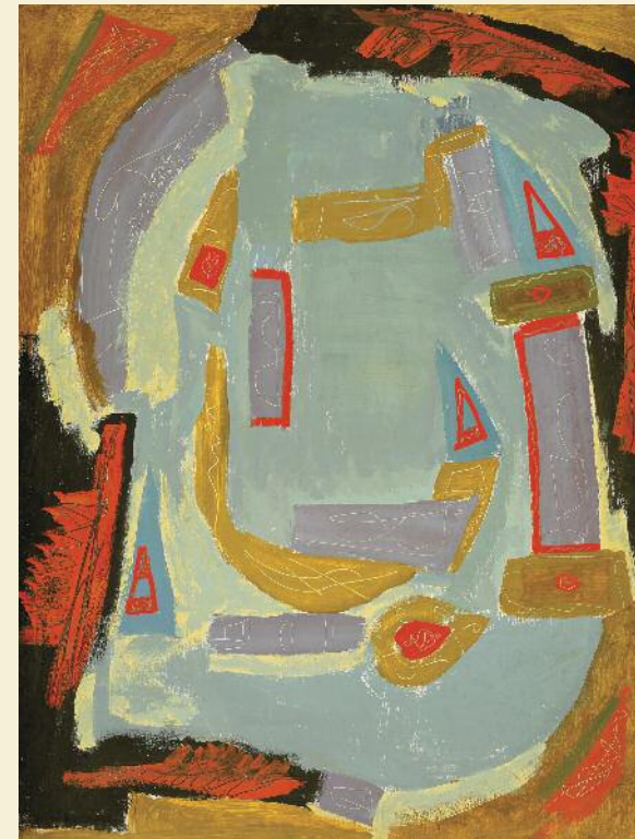
Betty Parsons, Gulf of Mexico , c. 1951. Gift of the Betty Parsons Foundation. (On view in Across Time & Place )