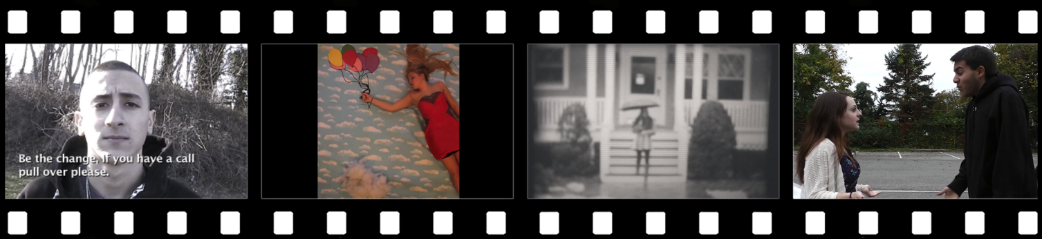
Be the change, if you have a call pull over please.

MUSIC VIDEOS, COMMERCIALS, DOCUMENTARIES, SILENT 8 MM FILM, SHORT STORIES, STOP MOTION, PSA, ART MOVEMENT, EXPERIMENTAL